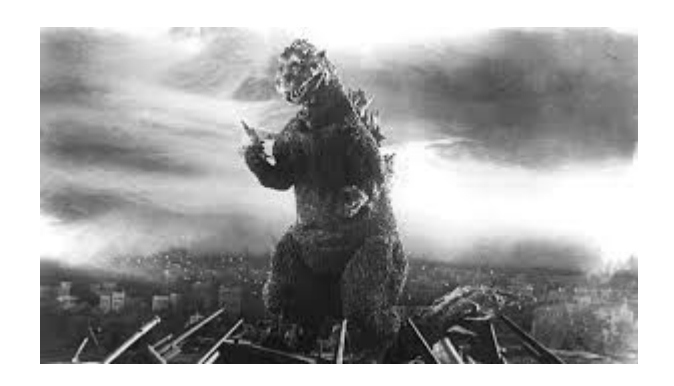
THE EDITOR'S GODZILLA