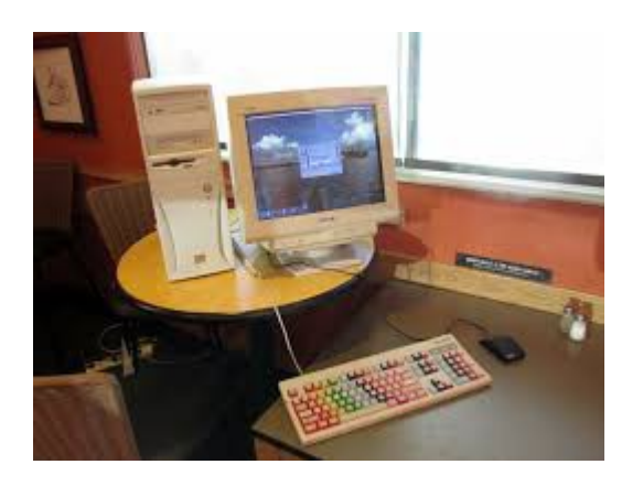
NOVEMBER SCCAN MEETING... KIND OF...