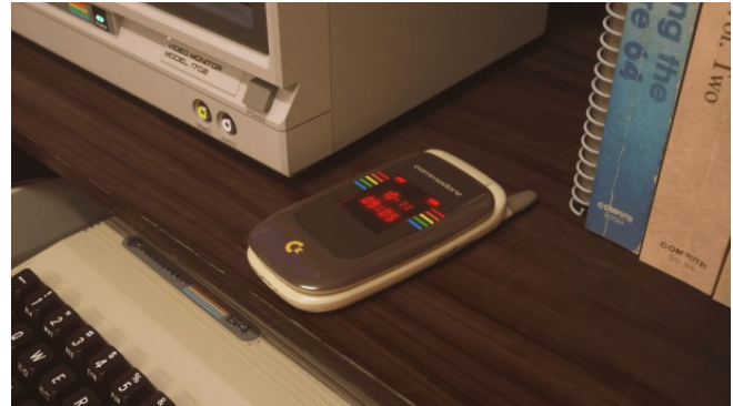
Commodore Callback 8020

Commodore is launching the Callback 8020, a flip phone for retro fans. With no browser or social media, digital detox is the focus.